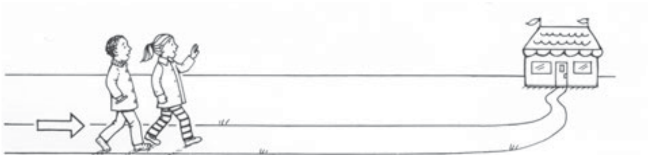
to the store

Show how many friends and dogs Janet and Andy saw each way.